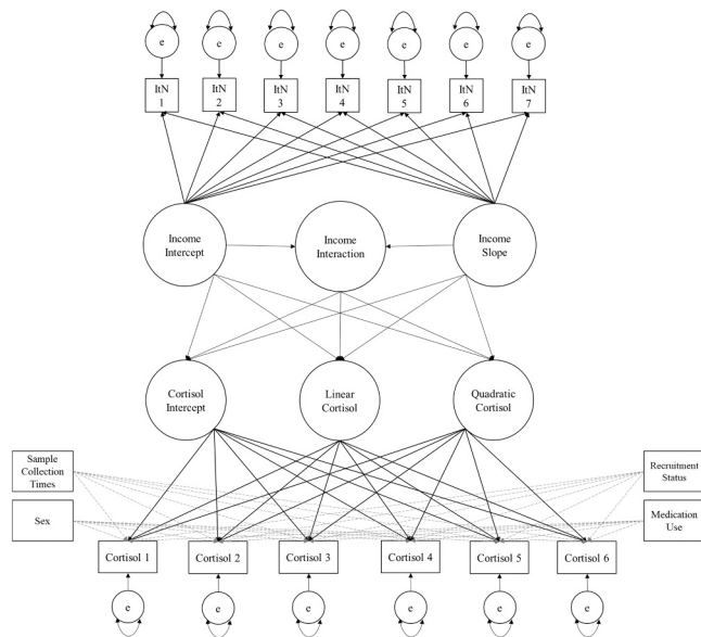
Fig. 2. Path diagram of average income-to-needs (intercept), income-to-needs change (slope), and income-to-needs intercept X slope interaction predicting acute HPA responses. Note: ITN = Income-to-needs ratios; Cortisol # = Cortisol Sample #; Income = Income-to-needs; Factor loadings for Income-to-needs intercept = 1, 1, 1, 1, 1, 1, 1; Income-to-needs slope = -6, -5, -4, -3, -2, -1, 0; Cortisol intercept = 1, 1, 1, 1, 1, 1, 1; Linear Cortisol = 0, 0.5, 1, 1.5, 2, 2.5; Quadratic Cortisol = 0, 0.25, 1, 2.25, 4, 6.25.

U-shaped curves of cortisol reactivity. Income-to-needs slope was not a significant predictor of linear or quadratic cortisol slopes. Lastly, adolescents' risk for depression (indexed by sub-clinical depressive symptoms on the C-DISC and MASQ) positively predicted linear cortisol slope, such that youths who reported greater depressive symptoms evinced flatter linear slopes, indicating less cortisol decline post-stressor.